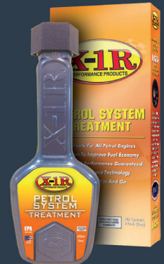
X - 1R BRAND (USA)