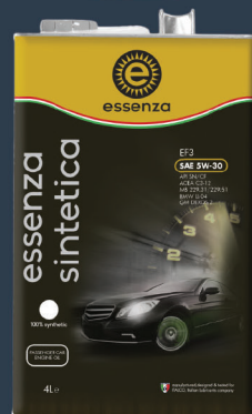
ESSENZA BRAND (ITALY)