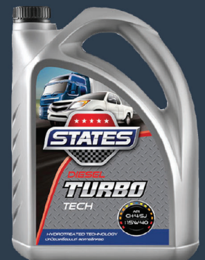
STATES BRAND (THAILAND)