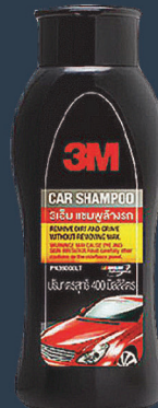
3M Auto Care Leather Cleaner (USA Version)